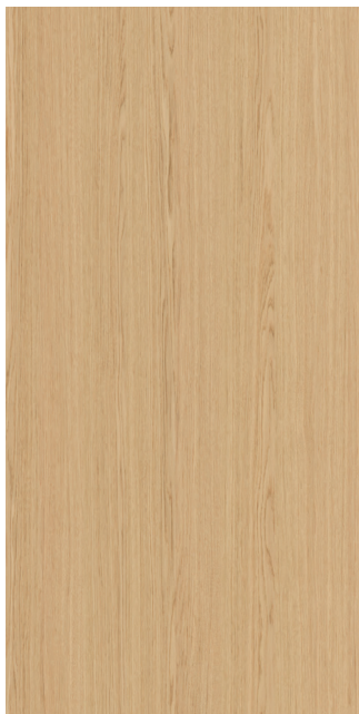
RIFT CROWN MIXMATCH